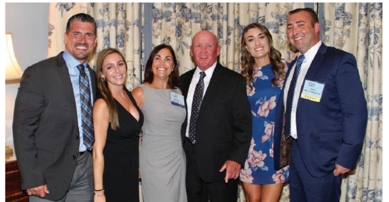
The MacDonald Family