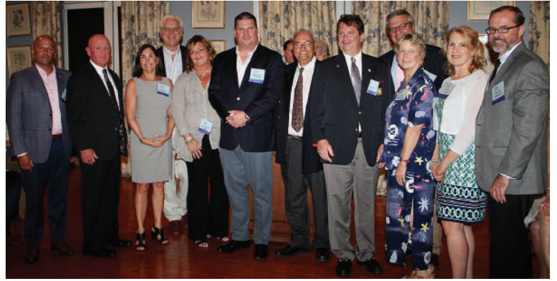
New Regular Memebers