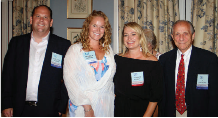
New Founding Memebers